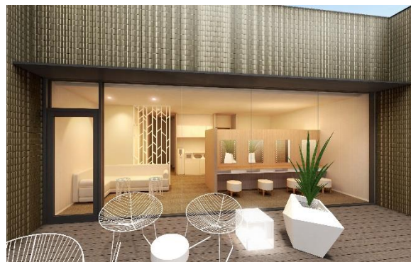
Powder room for women