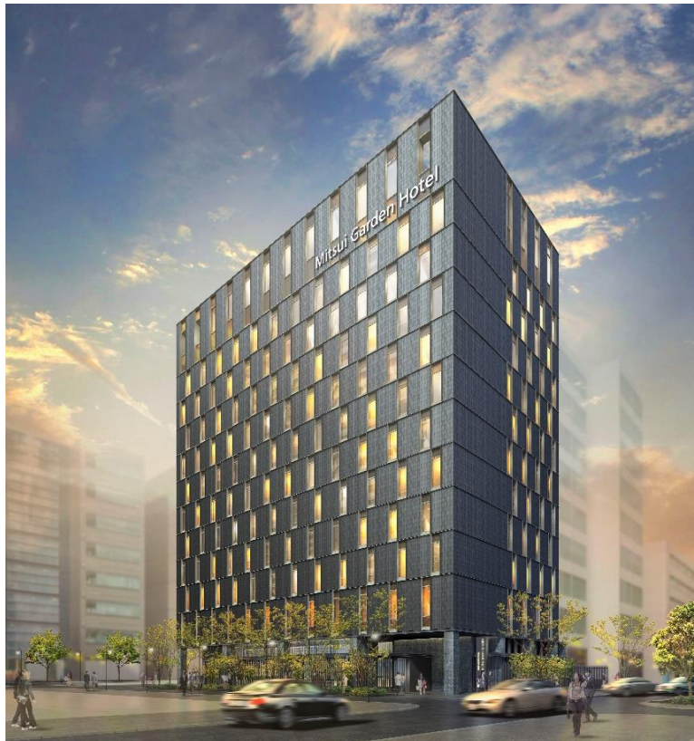
Image of the completed exterior

Together with the Mitsui Garden Hotel Fukuoka Gion (300 rooms), which opened on Thursday, June 27, 2019, the hotels aim to be facilities offering a variety of guests from within and outside of Japan with a comfortable pace to spend their time.