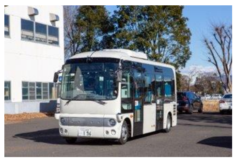
▲ Self-driving bus