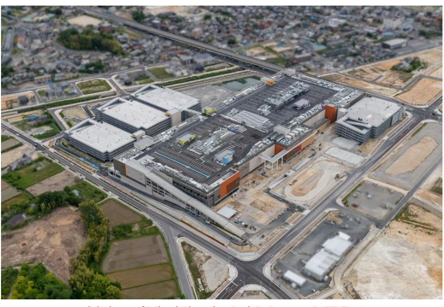
▲ Aerial photo of Mitsui Shopping Park LaLaport AICHI TOGO