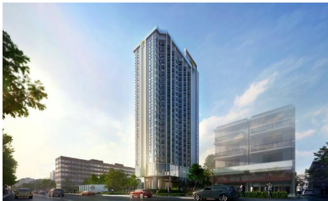
‘Somerset Blue Coast Pattaya’ Exterior CG

Located in central Pattaya, a beach resort town visited by many travelers from Thailand and abroad. Adjacent to CentralFestival Pattaya, a popular large-scale shopping mall, and located just a five-minute walk from Pattaya Beach, this area is incredibly convenient.