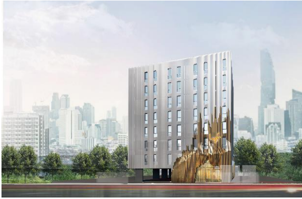
'Lyf Sukhumvit8 Bangkok' Exterior CG