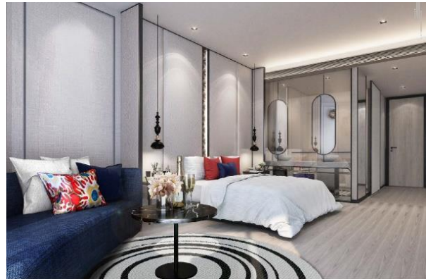
‘Somerset Blue Coast Pattaya’ Interior

Ananda, which will act as Mitsui Fudosan’s business partner in this project, is a major Thai developer that has demonstrated a solid track record through sales of condominiums in Bangkok and its suburbs. Ananda has so far co-developed over 29 properties and 24,000 condominiums with Mitsui Fudosan in the condominium business, but will participate in the SA business, where stable growth is expected, for the first time. The Mitsui Fudosan Group aims to seize further business opportunities in Thailand while maximizing the property development expertise it has cultivated up until now within Japan and developing this project in partnership with Ananda.