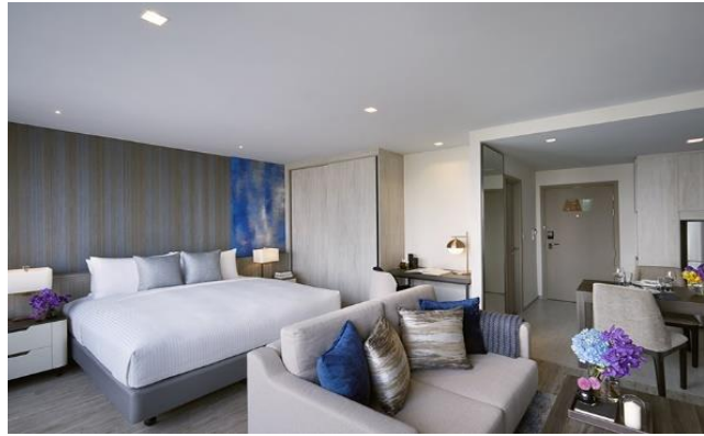
'Somerset Rama 9 Bangkok' Interior