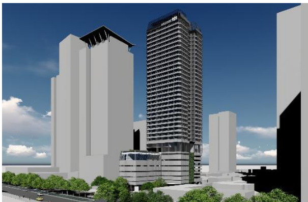
'Ascott Embassy Sathorn Bangkok' Exterior CG

Located in Sathorn, the center of the business and commercial districts where financial institutions and major corporations have their head offices. Home to a high concentration of hospitals, embassies, international schools, and popular restaurants, this area is incredibly convenient which makes it popular among expats and business travelers.