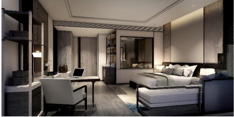
‘Ascott Thonglor Bangkok’ Interior

Located in central Pattaya, a beach resort town visited by many travelers from Thailand and abroad. Adjacent to CentralFestival Pattaya, a popular large-scale shopping mall, and located just a five-minute walk from Pattaya Beach, this area is incredibly convenient.