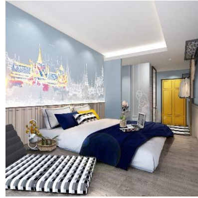
'Lyf Sukhumvit8 Bangkok' Interior