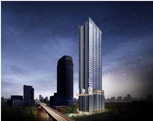
‘Ascott Thonglor Bangkok’ Exterior CG

Located in the Thonglor neighborhood which is the most popular residential area among expats, especially Japanese. With the Thonglor Station on the BTS only a three-minute walk away and a high concentration of international schools, hospitals and popular restaurants nearby, this area offers tremendous convenience.