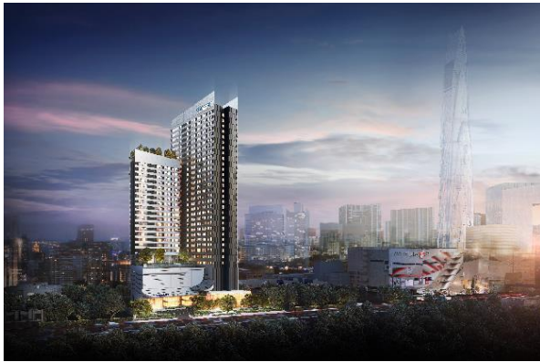
'Somerset Rama 9 Bangkok' Exterior CG

Located in the rapidly developing Rama 9 area, where streets are lined with many shopping centers as well as office buildings and large-scale development is still under way. With the expressway ramp nearby, this location is suitable for access to Suvarnabhumi Airport and all areas within Bangkok.