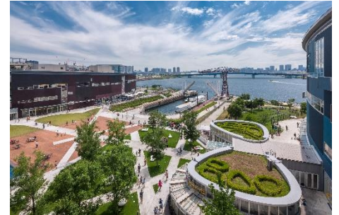
Urban Dock LaLaport TOYOSU

The hotel is extremely close to the center of the city, approximately 3 km in a straight line from the Ginza area and approximately 4 km from Tokyo Station, with excellent access to transport, connecting directly to Toyosu Station on the Tokyo Metro Yurakucho Line and the Yurikamome Line. Furthermore, a Limousine Bus can be taken from the adjacent bus terminal, offering access to Haneda Airport in approximately 20 minutes or Narita Airport in approximately 70 minutes. The hotel is thus perfectly situated as a base for activities for both Japanese and overseas guests. There are numerous popular sightseeing spots in the vicinity, such as Toyosu Market, and the hotel connects directly to a large-scale retail property, Mitsui Shopping Park Urban Dock LaLaport TOYOSU. The location therefore offers easy access to sightseeing spots around Toyosu, as well as a useful base for sightseeing in Tokyo.