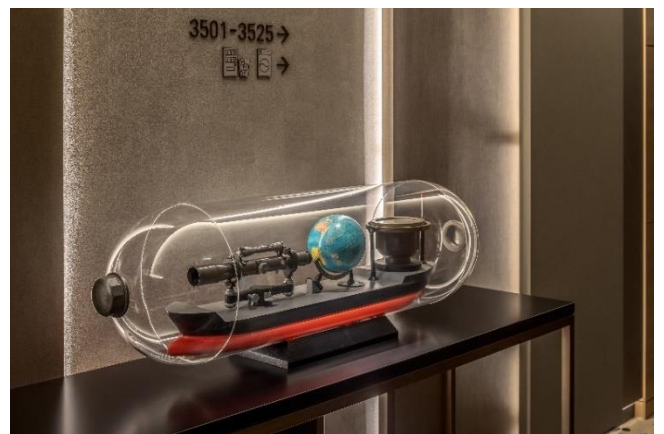
35th floor local elevator hall Artwork name: Tabi no Dougu no Tabi (“Journey of the Traveling Equipment”) Artist: Bunpei Kado