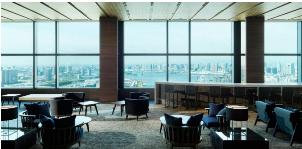
Panoramic view of Tokyo Bay from an elevation of 165 m

The hotel spaces celebrate the view from the 165 m elevation as the main feature, with a water motif symbolizing the Toyosu bayside area present throughout. To reflect the Toyosu area’s local history as a shipbuilding area, the entire interior of the hotel presents a story of an ocean voyage. Passing through the basement floor and first floor hotel entrance, which recreate “under the sea” and “rising to the surface”, guests reach the 36th floor lobby where they started their individual “sky voyage.” Guests are greeted by the panoramic view of Tokyo Bay, which forms a suitable scene for the embarkation point for their “voyage.”