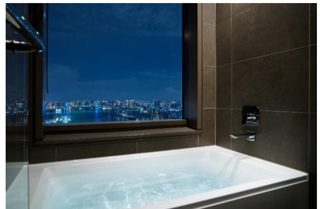
View Bath offers an enjoyable bath with a view