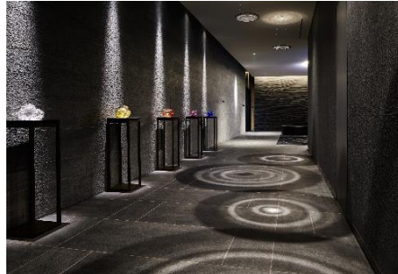
First floor elevator approach Artwork name: Hamon (“Wave Pattern”) Artist: Chisa Imamura