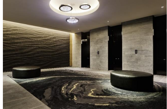
First floor entrance