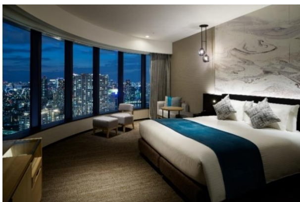
Guestroom (Executive view bath corner king)

The “View Bathroom,” offers expansive views of Tokyo Bay, making these special guestrooms a perfect choice for an important occasion such as an anniversary.