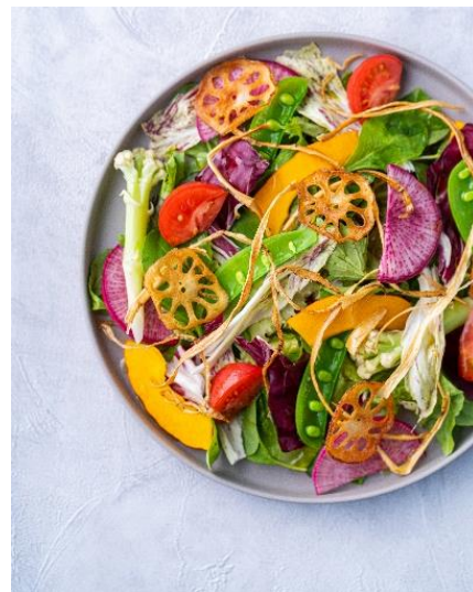
Sample image of dishes on offer