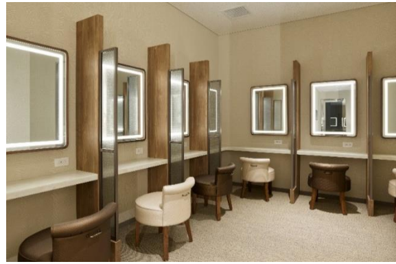
Women's powder room