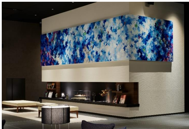
36th floor lobby Artwork name: Ao no Chikaku (“Close to the Blue”) Artist: Satoshi Uchiume