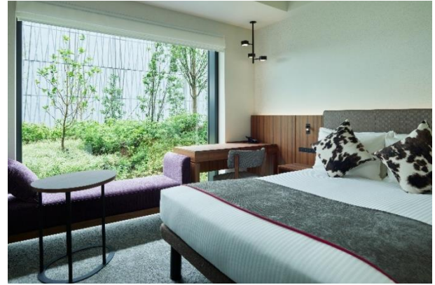
Guestroom (Moderate Double)