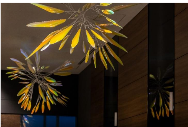
36th floor local elevator hall Artwork name: Air Line_Mobile_Yamabuki Henkou (“Air Line_ Mobile_Bright Yellow Polarized Light”) Artist: Kosei Komatsu