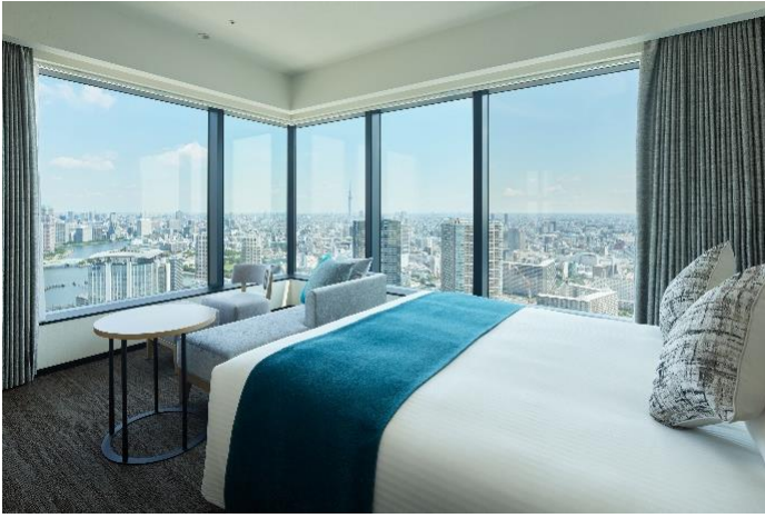
Guestroom (Deluxe View Bath Corner King)