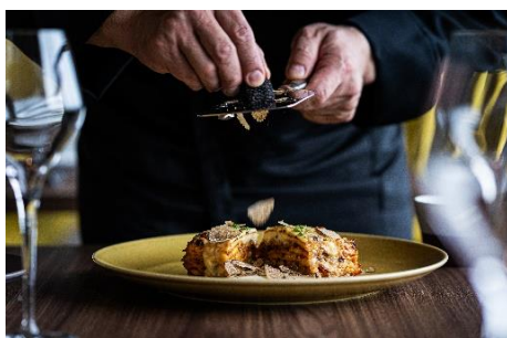
Sample image of dishes on offer