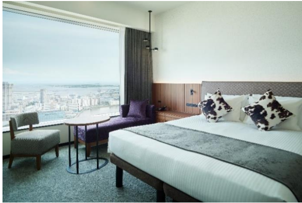
Guestroom (Comfort Double)