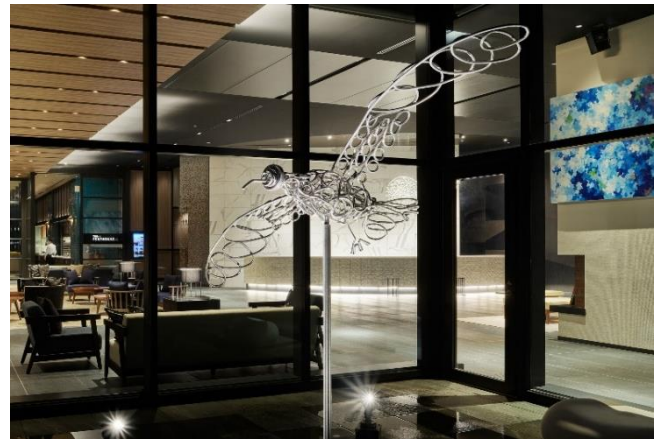
36th floor lobby terrace Artwork name: Watari Dori (“Migratory Bird”) Artist: Jin Hasegawa