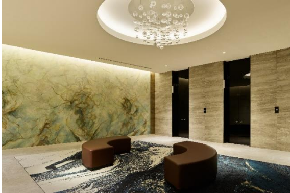
First basement floor entrance

The theme for the first floor entrance is “rising to the surface” from under the sea onto the land. Art lighting using glass expresses the appearance of breaking through from under the water up to the surface. The light and shadow reflected on the ceiling and floor and the glass carving in the elevator hall recall the Toyosu seaside at night.