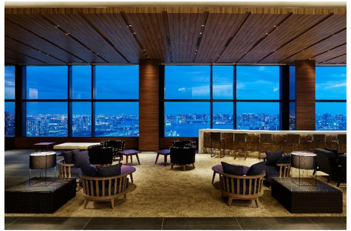
View from the lobby at an elevation of 165 m