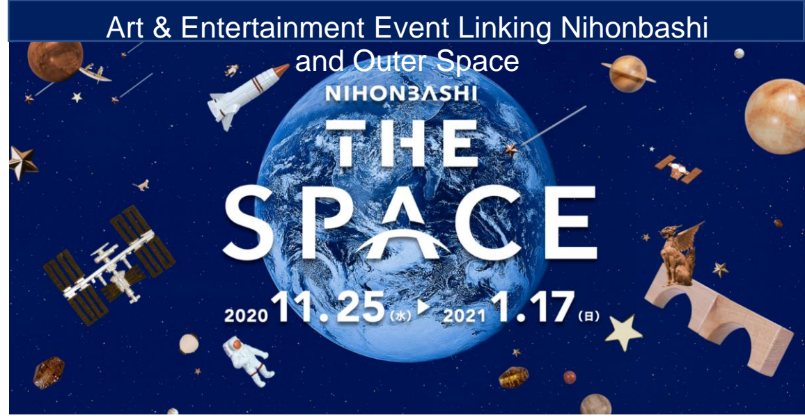
Key Visual for NIHONBASHI THE SPACE

Mitsui Fudosan has designated aerospace as an area of concentration under the Nihonbashi Revitalization Plan's priority initiative: a focus on tomorrow's innovative industries. Nihonbashi is currently home to the aerospace business center X-NIHONBASHI and an array of aerospace-related companies. The gathering of such sites and players inspired Mitsui Fudosan to host NIHONBASHI THE SPACE, the first such business-to-consumer (B2C) event. Mitsui Fudosan also plans to hold a multitude of aerospace-related entertainment, education, and other events in the future in Nihonbashi. (Special Event Website: <a href="https://nihonbashi-thespace.jp">https://nihonbashi-thespace.jp</a>)