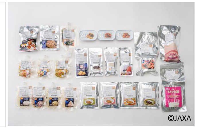
eslite spectrum nihonbashi Space Exhibition