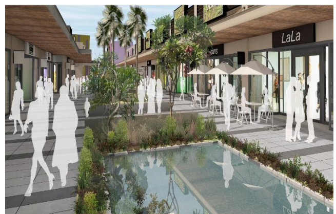
Perspective drawing of MITSUI OUTLET PARK TAICHUNG PORT Phase 2 interior