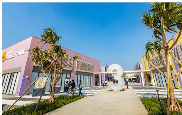
MITSUI OUTLET PARK TAICHUNG PORT Phase 1 exterior