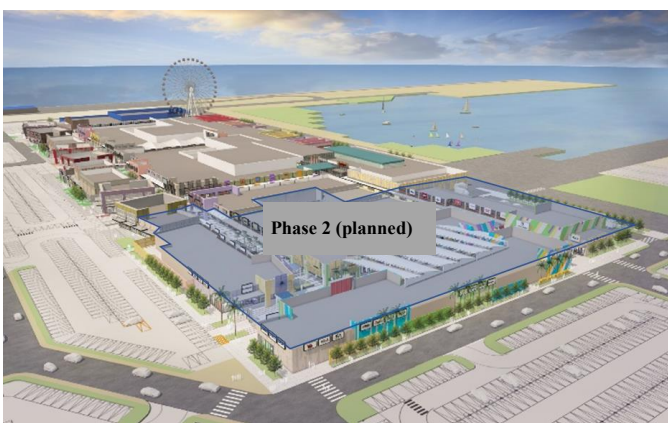
Perspective drawing of total area of MITSUI OUTLET PARK TAICHUNG PORT