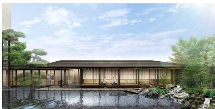
CG image of the completed cottage

* Regarding events and the like, the status of the COVID-19 outbreak will be monitored closely and appropriate content and methods will be considered following discussions and instructions from supervising government organizations on the premise of assuring safety.