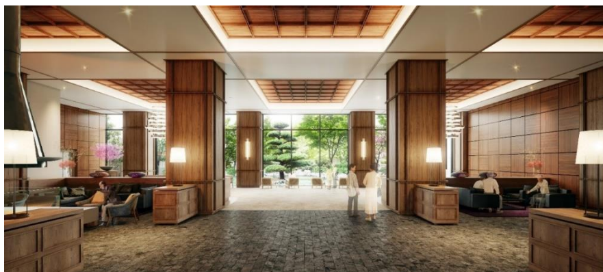
CG image of the entrance hall

Then, utilizing the scale of the property with 548 units in total, the entrance and other areas of the building serving as its window to the world have been luxuriously designed to enhance the broad expanse and high ceilings.