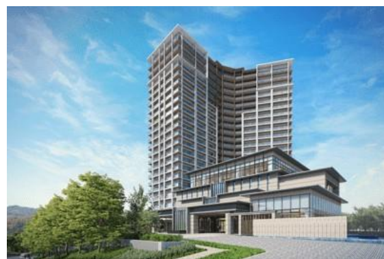
PARK WELLSTATE Kamogawa