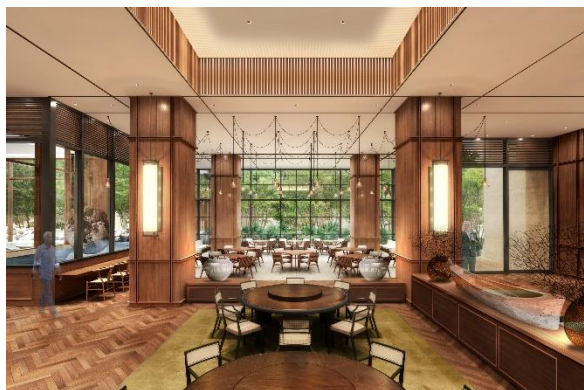
CG image of the completed main dining hall

The property includes restaurants with operations outsourced to GREEN HOUSE CO., LTD., large communal and open-air baths, multipurpose halls, billiard tables, mahjong rooms, karaoke rooms, piano rooms, lounges, libraries, and other entertainment facilities and events. For holding events, there is a separate cottage and multipurpose hall to enable direct entry for those coming from outside, and various events and programs will be held among residents and between residents and members of the local area to create a community space. In addition to creating club activities and other active events to utilize shared facilities in the building, planning is moving ahead on events and activities to utilize the rich natural tourism resources of the Hokusetsu area.