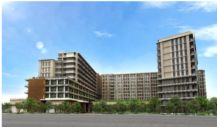
CG image of the completed PARK WELLSTATE Toyonaka Project (tentative name)

This project is the third property in the PARK WELLSTATE series, following the openings of PARK WELLSTATE Hamadayama in June 2019 and PARK WELLSTATE Kamogawa in November 2021. The project is the first property in the PARK WELLSTATE series to open in the Kansai region.