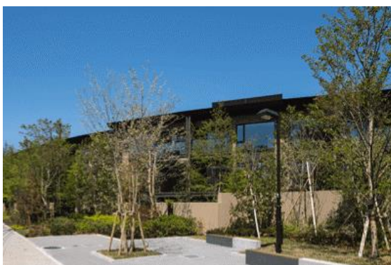
PARK WELLSTATE Hamadayama