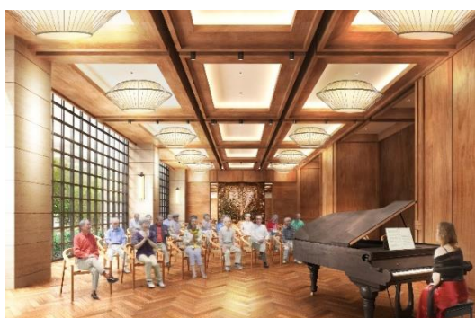
CG image of a completed multipurpose hall