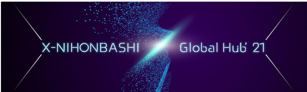
X-NIHONBASHI Global Hub '21 promotional artwork

NASA Ames, JAXA, and X-NIHONBASHI (Mitsui Fudosan) will co-host an in-person business matching event between Japanese and US companies at NASA Ames's California base (scheduled to be held in August 2021) in conjunction with the Space Symposium, the world's largest business conference for the aerospace industry, held in Colorado, USA. In addition, by arranging events before and after as a series of programs in Nihonbashi throughout the year, the three parties will co-create high-quality and effective opportunities, and offer a business matching program extending a bridge to the world from Nihonbashi, which was the starting point of the Five Main National Roads during the Edo period (1603-1868)