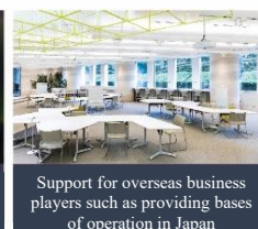
Conceptual outline of X-NIHONBASHI Global Hub