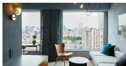
sequence MIYASHITA PARK