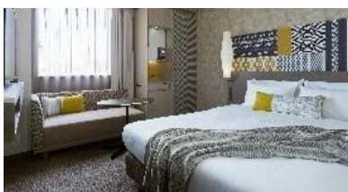
Mitsui Garden Hotel Fukuoka Gion