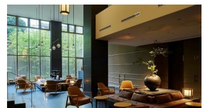
HOTEL THE CELESTINE KYOTO GION