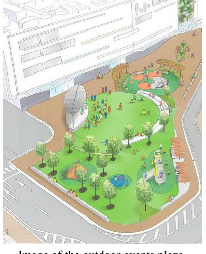
Exterior view of LaLaport FUJIMI