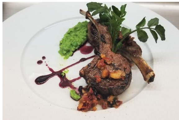
Lamb Chop Dish