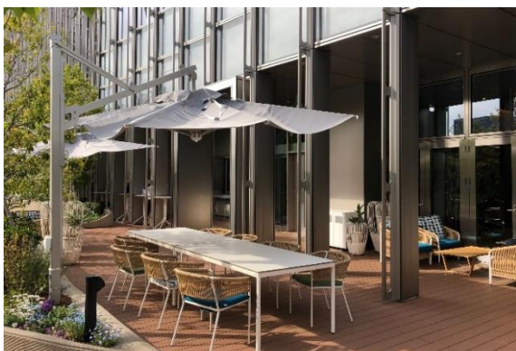
9F Sky Garden