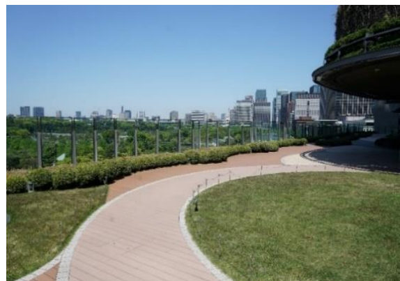
6F Park View garden