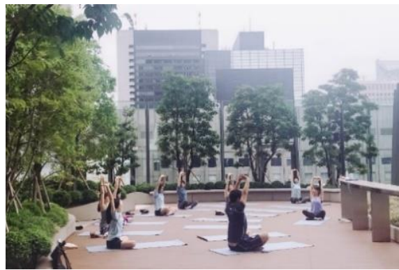
Yoga event (9F Sky Garden)