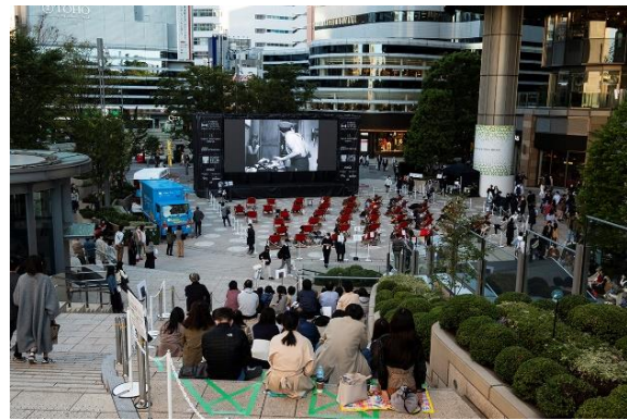
Example of community event Hibiya Cinema Festival held annually in October and November (Hibiya step open space)