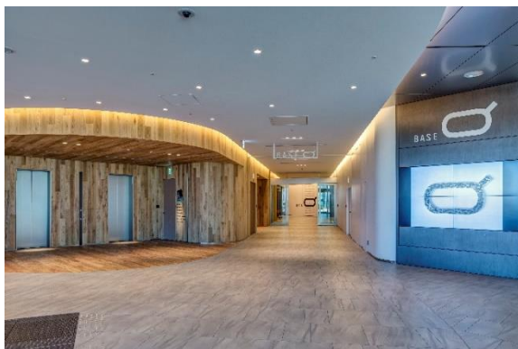
6F BASE Q