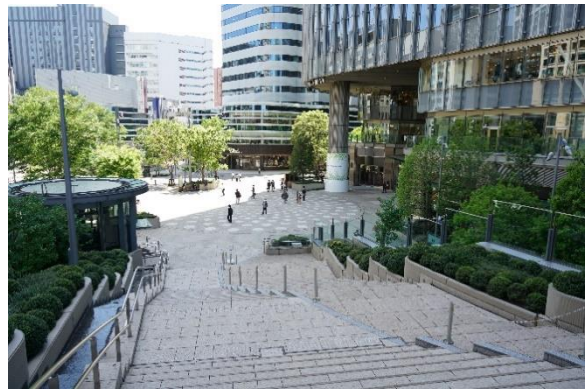
Hibiya step open space