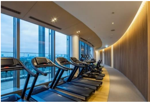
8F Park Wellness