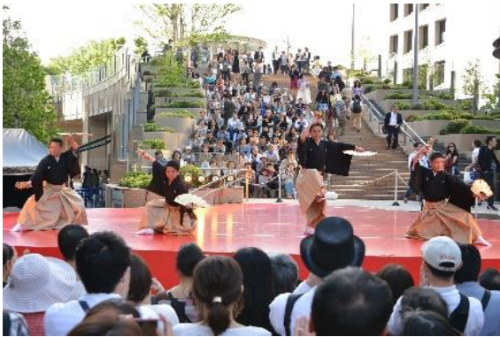
Example of community event Hibiya Festival held annually in April and May (Hibiya step open space)