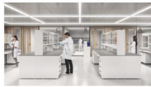
Rental wet lab

[Implementation of Healthcare Innovation] MED Center for Healthcare Innovation