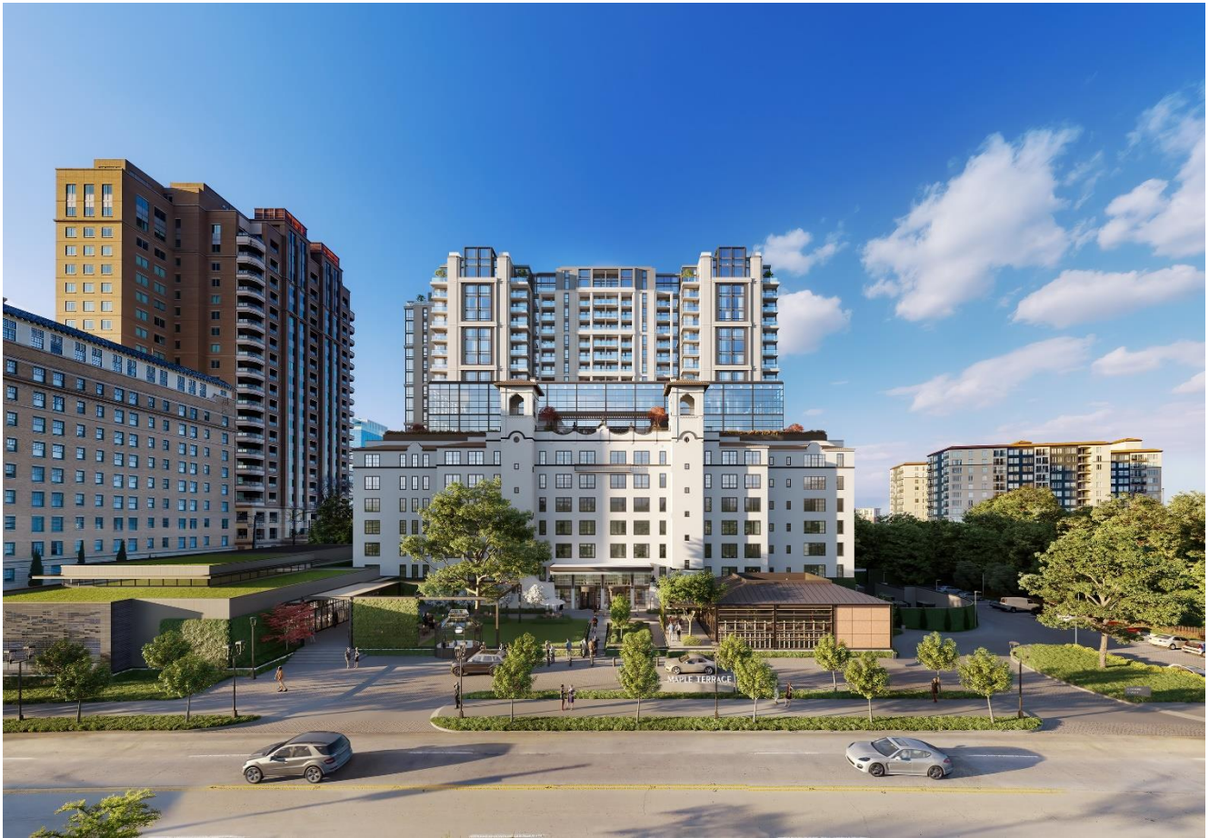
Rendering of Maple Terrace Exterior