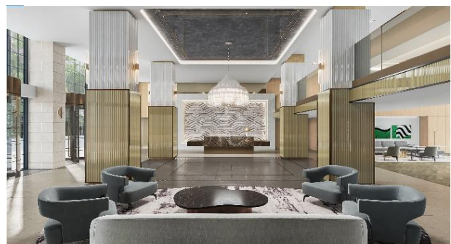
Rendering of office wing's entrance lobby