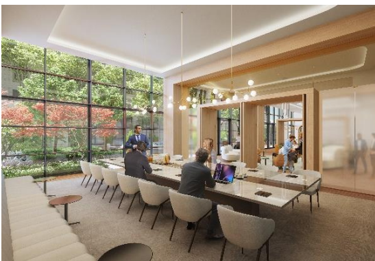
Rendering of office wing's common area