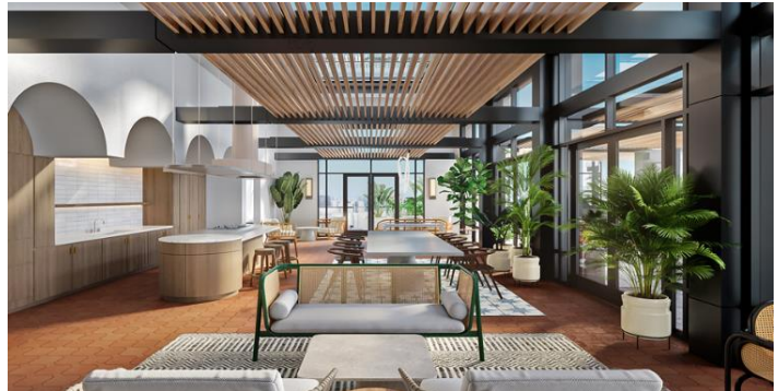
Rendering of rental housing wing's common area and rooftop lounge