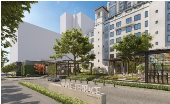
Rendering of entrance

The Group's business partner for this project is Hines, a major real estate developer based in Houston, Texas and operating around the world.