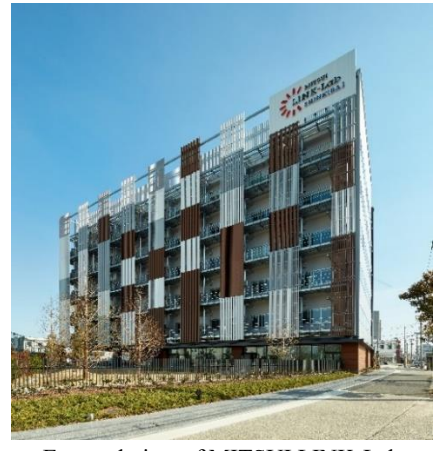
External view of MITSUI LINK-Lab

* Mitsui Fudosan provides leased land from the landowner to tenants after developing the building