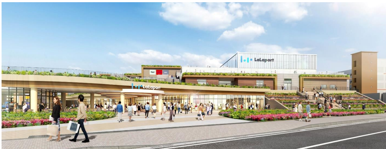
LaLaport FUKUOKA Exterior concept

Spaces overflowing with activity will be created to serve as community centers, including a multifaceted park (plaza) where many different types of people will gather, and contribute to fascinating neighborhood creation as a new hub in Fukuoka City. Information such as detailed plans for the park and installations will be announced in the future.