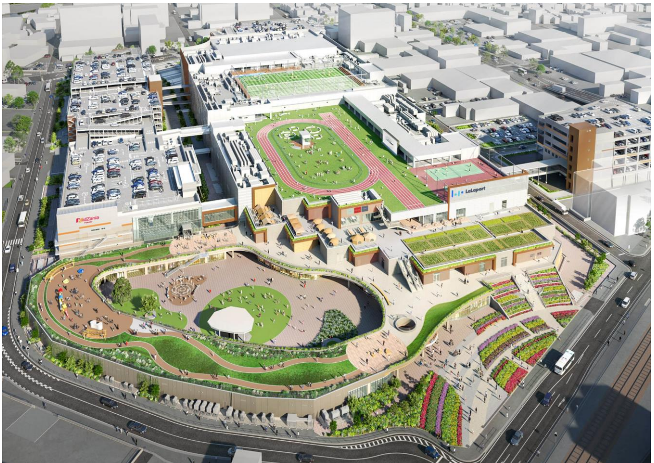
Bird's-eye view of LaLaport FUKUOKA

KidZania, a facility where children roleplay to experience careers and society, and Toy Museum, Japan's largest facility for learning and multigenerational exchange through interaction with wood, will also make their Kyushu debuts along with LaLaport FUKUOKA. Mitsui Shopping Park LaLaport will help provide high-quality education while striving to be a facility that customers from a wide variety of age groups can enjoy through things like shopping and entertainment.