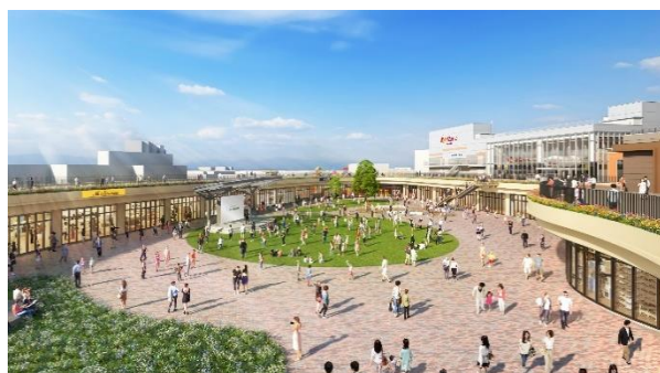
LaLaport FUKUOKA Plaza concept