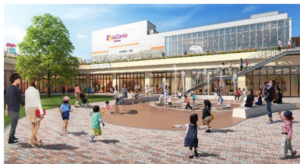
LaLaport FUKUOKA Building concept