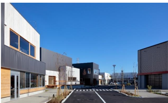
KOIL 16 Ichiroku Gate by Mitsuifudosan

The facility will promote interaction between residents, town visitors and entrepreneurs, and aim for community creation unique to Kashiwa-no-ha Smart City.