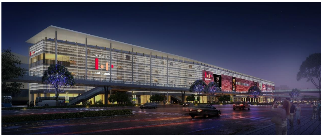
Perspective drawing of the facility exterior

In addition, a striking exterior has been created that is well suited to a facility with direct access to Lianhua Road Station, an important location on the Shanghai Metro Line 1. This was accomplished by adopting two colors for the building's outer walls: red, which is the color of the Shanghai Metro Line 1 that serves Lianhua Road Station, and the bright pink of lotus flowers, reflecting the Chinese word lianhua , which means “lotus flower.”