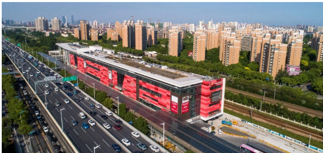
Building exterior of LaLa station SHANGHAI LIANHUA ROAD

Tokyo, Japan, December 10, 2021 – Mitsui Fudosan Co., Ltd., a leading global real estate company headquartered in Tokyo, announced today that Mitsui Shopping Park LaLa station SHANGHAI LIANHUA ROAD (Chinese name: Mitsui Shopping Park 啦啦荟城 (la la hui cheng) 上海莲花路) (hereinafter, “LaLa station SHANGHAI LIANHUA ROAD”) will open for business in Lianhua Road Station on the Shanghai Metro Line 1, through Shanghai Minsan Retail Properties Management Co., Ltd., a project company established with a 100% investment by Mitsui Fudosan to implement the project. The retail facilities complex will be Mitsui Fudosan's first overseas retail facilities in a station building. Some stores on the 1st and 2nd floors of the retail facilities complex will pre-open when a passageway linking the Metro station and the bus terminal is opened to the public on December 10. Thereafter, LaLa station SHANGHAI LIANHUA ROAD will have its grand opening on December 22.