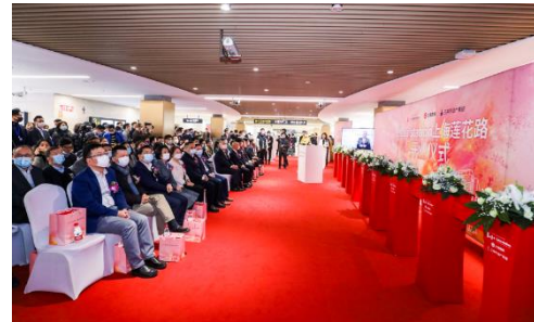
At the opening ceremony held on December 10