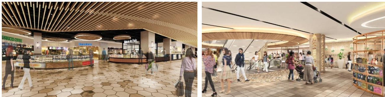
Perspective drawing of the facility interior

The facility interior is based on the design concept of “Lianhua Promenade,” making the most of the facility’s elongated shape, which spans approximately 300 m in an east-west direction. Water Road, Green Road, Flower Road, Forest Road, and Sunlight Road have been set as themes for the 1st to 5th floors, respectively. The interior design, lighting, materials and other elements are arranged to embody each theme. The interior spaces are designed so that people can feel as if they are enjoying a stroll along neighborhood streets while appreciating nature, even while they are indoors.。