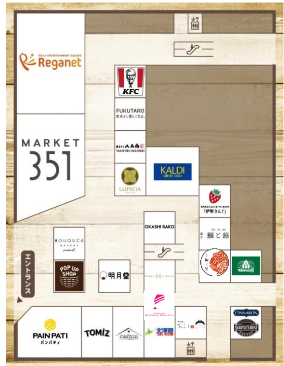
food marche store map