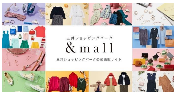
Mitsui Shopping Park &mall screenshot

Mitsui Shopping Park &mall is the Mitsui Shopping Park official online shopping site. The site carries a wide range of products from approximately 400 stores, centered on highly popular fashion brands through to lifestyle products. Visitors can use the site to check stock before coming to LaLaport FUKUOKA, or buy products online at a later date and experience shopping while mutually utilizing both brick-and-mortar and online stores.