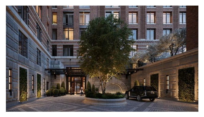
Porte Cochère in Front of Entrance (CGI)

The Cortland is comprised of 144 residential units and state-of-the-art amenities for leisure and wellness, such as an event lounge, kids room, squash court, gym, and pool, as well as a porte cochère, a rare feature in Manhattan. This project is a joint venture with Related Companies, the most prominent privately-owned real estate firm in the United States, with whom we have worked previously with at 55 Hudson Yards and 50 Hudson Yards located in New York's newest neighborhood on Manhattan's West Side.