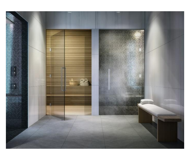
Spa in shared area (CGI)