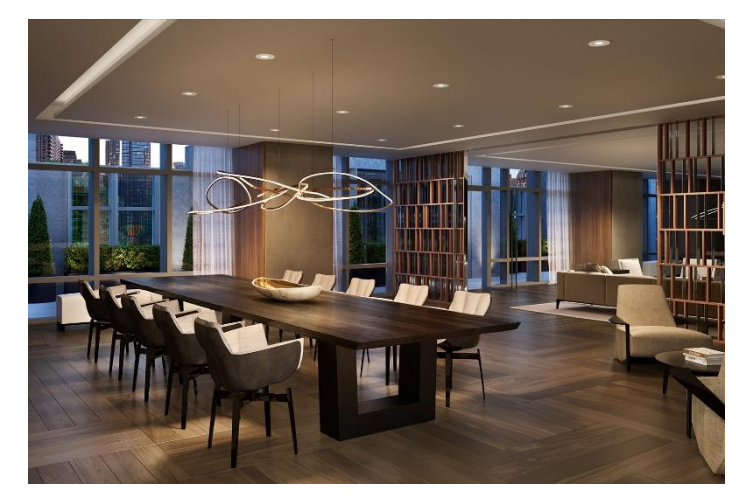
Dining Room in Shared Area (CGI)

The Upper West side of Manhattan, is a prestigious residential area with historic districts nearby, making this development opportunity exceptional. Furthermore, this property sits in an area rich in culture, education, and nature; the American Museum of Natural History, the Metropolitan Opera House and Concert Hall, Juilliard School, Lincoln Center for the Performing Arts, Central Park, Riverside Park and the Hudson River, which hosts a beautiful view of the water and evening scenes, are all within walking distance. This project is jointly operated with SJP Properties, a real estate developer with extensive experience developing both residential and office buildings in New York.