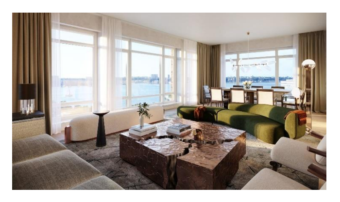
Exclusive Use Living Room in Residence (CGI)