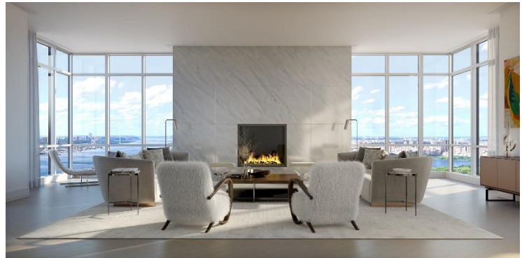
Left: Exterior of The Cortland (CGI); Top Right: Exterior of 200 Amsterdam (CGI) Bottom Right: Interior 200 Amsterdam (CGI)