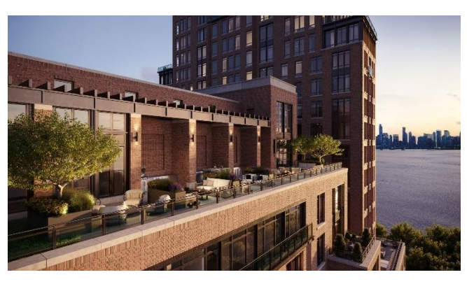
Roof-Top Terrace (CGI)