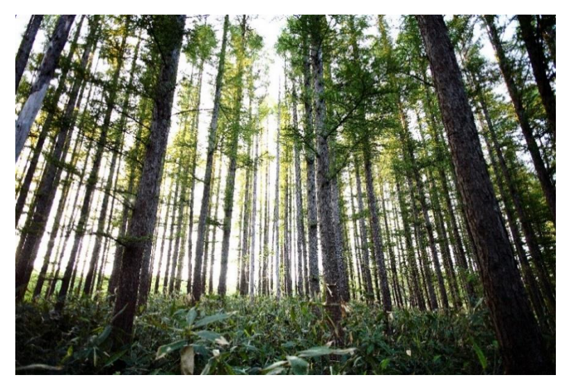
A Mitsui Fudosan Group-owned forest in Shimokawa Town, Hokkaido.

* FORESTOCK Certification is a certification system created in 2009 by the Forest Management Association of Japan.