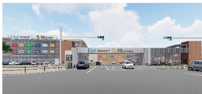
Newly established crossroads (Conceptual image)

Mitsui Fudosan will collaborate with KEIHAN BUS Co., Ltd. to set up new bus routes and create bus stops in transportation plazas within the complex. (Application pending)