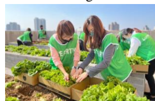
Vegetable garden facility on outdoor terrace