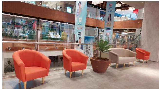
Rest areas within the buildings