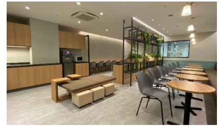
< Employee lounge >