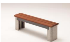
Cooking stove bench (image)

The facility is equipped with features such as cooking stove benches, manhole toilets, and 24-hour emergency power generators, and this equipment will be used in the event of a natural disaster