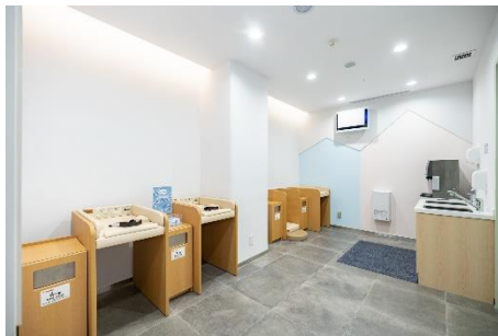
Diaper changing space