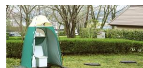
Manhole toilet (image)