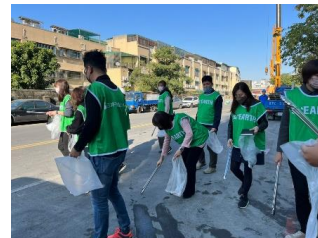
Community clean-up activities