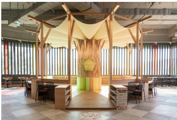
Kids’ Space Within Food Court (South Building)

The Kids’ Space is an approximately 50 m 2 area where children can remove their shoes and play. The area is divided into two zones: a green area for infants aged 0 to 1 year old, and an orange area for children aged 1 year and older. Mitsui Fudosan makes it easier for customers visiting the shopping mall as a family to use the Food Court by providing spaces for children to play before and after meals. In addition, the tables surrounding the Kids’ Space have secure chairs for children, allowing customers to dine leisurely with their children with peace of mind.