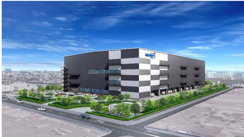
<Perspective drawing of exterior>

Good access to Ken-O Expressway, Tomei Expressway and National Route 246 Developed as a mixed-use facility with a multi-use zone for laboratories and offices