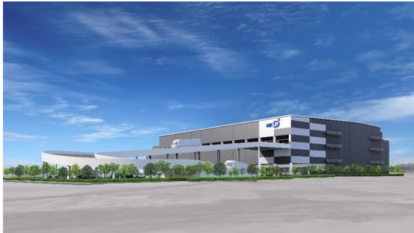
<Perspective drawing of exterior>

Logistics facility suitable for wide-area delivery with access to the Kan-Etsu Expressway and Chuo Expressway via the Sayama Hidaka interchange on the Ken-O Expressway Large surrounding population and favorable area for securing employment