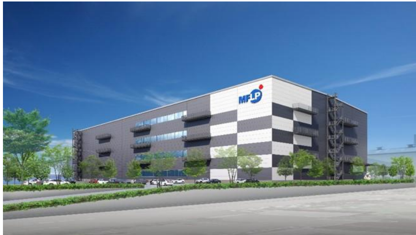
<Perspective drawing of exterior>

Excellent logistics location for deliveries to the entire Kansai region, as well as local deliveries to Osaka and Kobe City