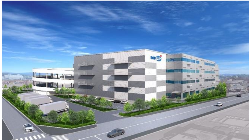
<Perspective drawing of exterior>

Close to National Route 16 and the Iruma interchange on the Ken-O Expressway, its location is suitable for wide-area delivery One of the few multi-tenant logistics facilities in around Iruma