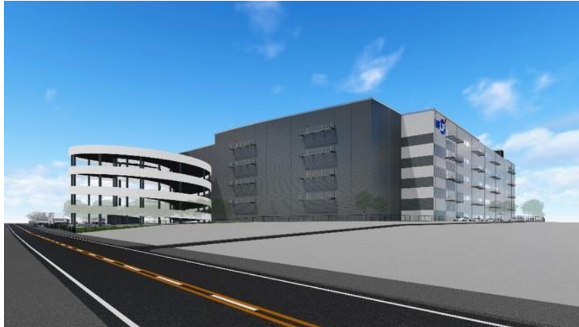
<Perspective drawing of exterior>

Logistics facility capable of delivering products to the greater Tokyo metropolitan area and the Tohoku area