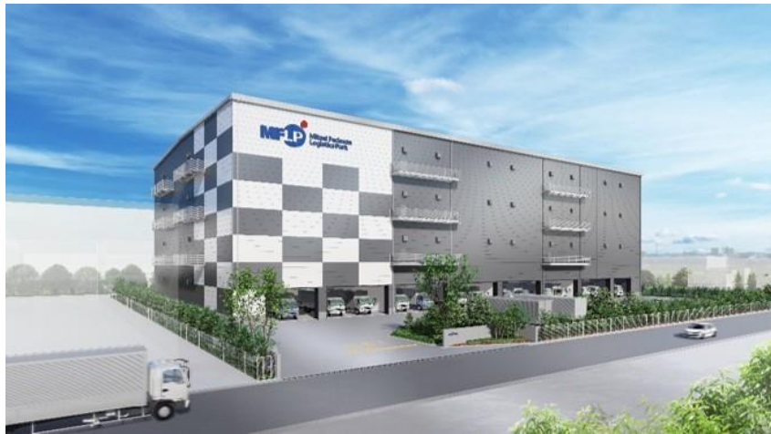
<Perspective drawing of exterior>

Excellent location with expected demand for distribution centers and frozen/refrigerated warehouses in the Tokyo metropolitan area