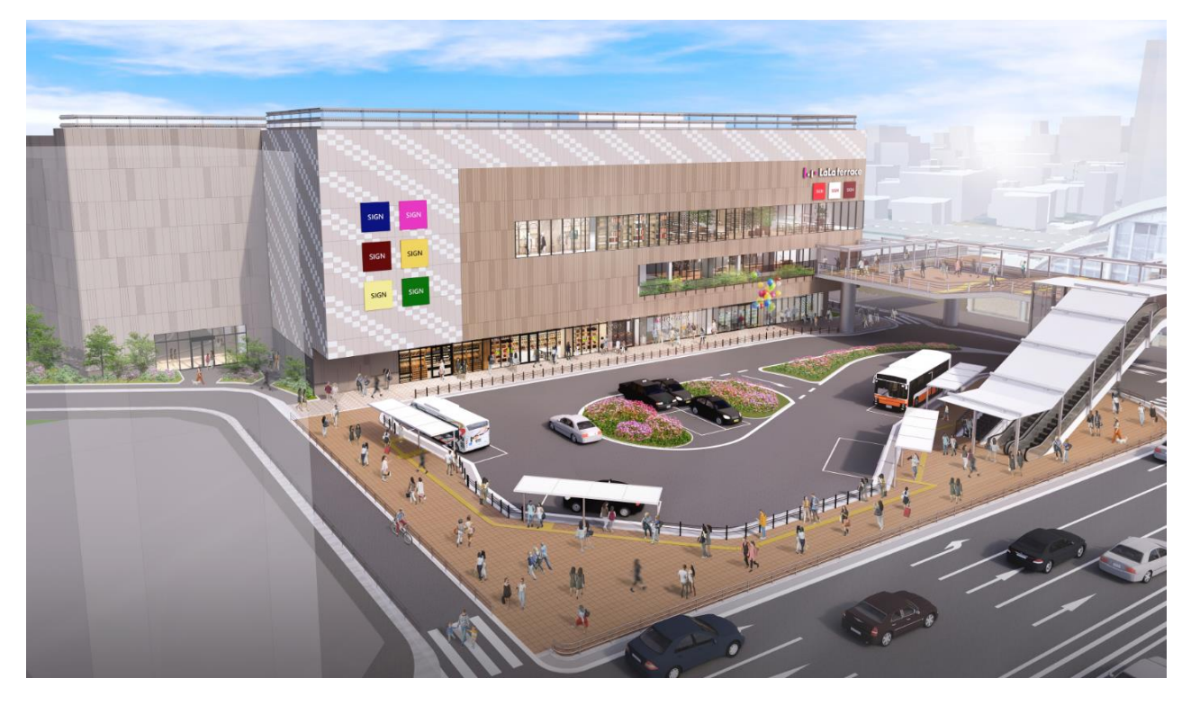
Conceptual aerial image (from the southwest side)

Mitsui Fudosan will implement sustainability measures, including reducing CO<sub>2</sub> emissions, through such means as efficient energy operation and management and the introduction of energy-efficient items.