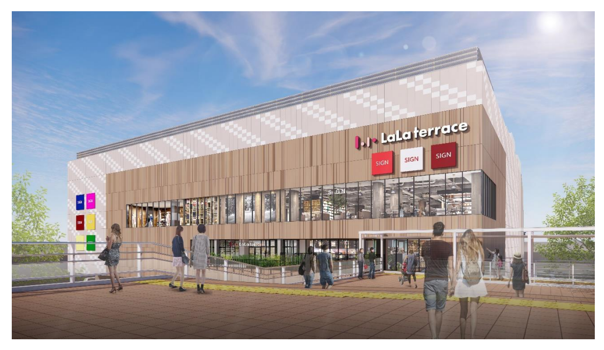
Conceptual image of the exterior of Mitsui Shopping Park LaLa Terrace KITA-AYASE (tentative name) (View from the pedestrian deck from Kita-ayase Station)

The facility will seek to improve daily convenience with a highly attractive retail environment, offering a full assortment of approximately 50 stores tailored to the daily needs of local residents. Efforts will also be made to realize a sustainable society by, for example, reducing CO_2 emissions through efficient energy operation and management and other means.