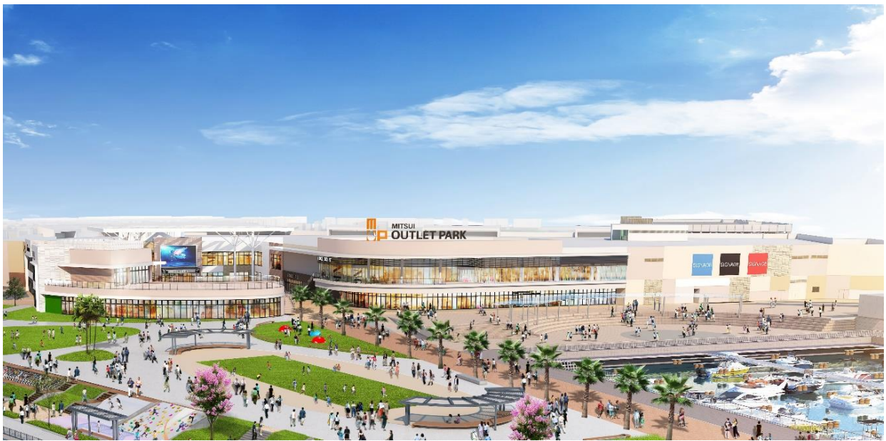
Computer generated image of the exterior of MITSUI OUTLET PARK MARINE PIA KOBE Reconstruction Project

*Marine Pia Labo: Established in 2019, hands-on workshops, seminars, and various events are held every day at this community space for local residents to connect and interact.