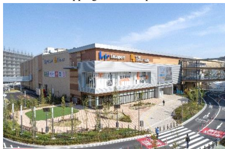
Mitsui Shopping Park LaLaport KADOMA and MITSUI OUTLET PARK OSAKA KADOMA