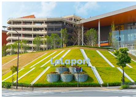
Mitsui Shopping Park LaLaport IZUMI