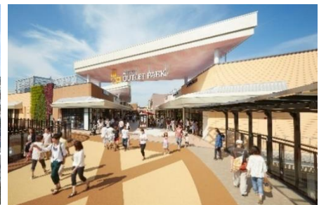
MITSUI OUTLET PARK SHIGA RYUO