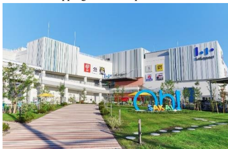
Mitsui Shopping Park LaLaport SAKAI