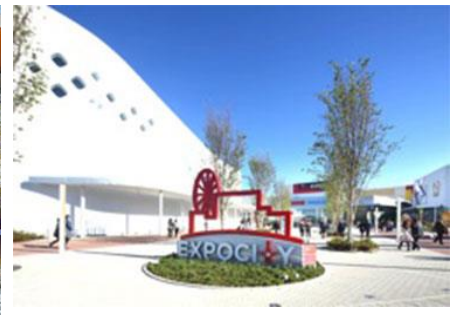
Mitsui Shopping Park LaLaport EXPOCITY