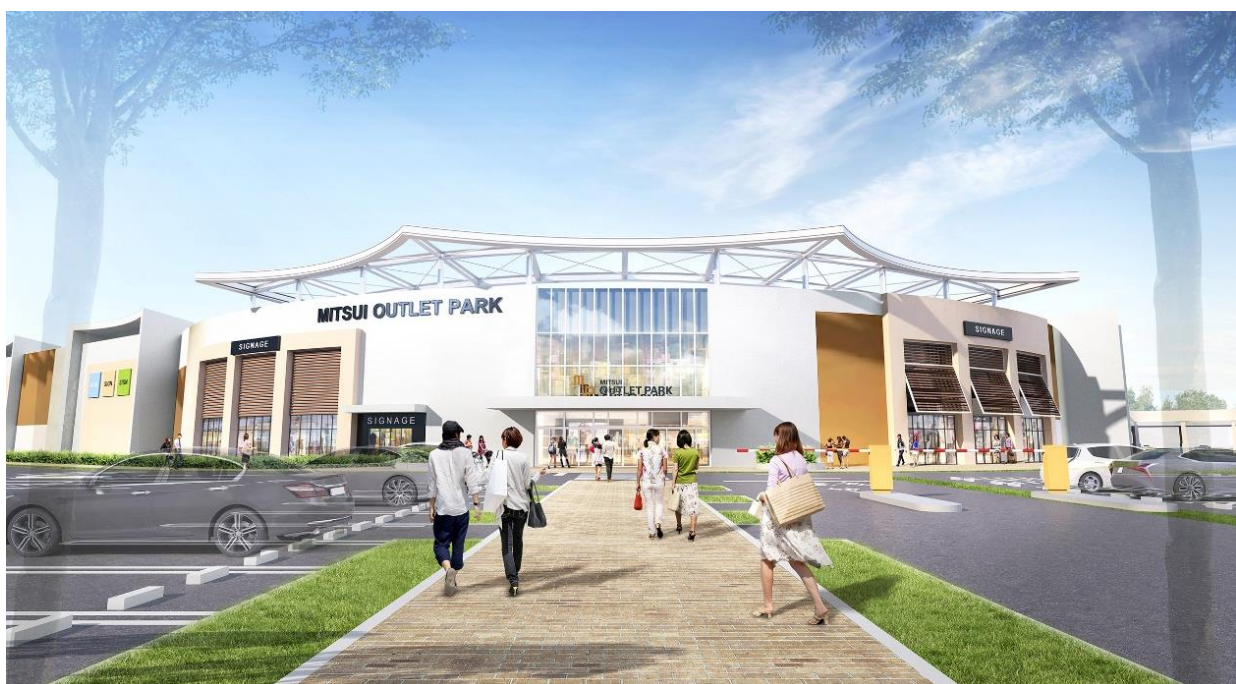
Computer generated image of Main Entrance of MITSUI OUTLET PARK MARINE PIA KOBE Reconstruction Project

It is conveniently located within walking distance from Tarumi Station and Sanyo-Tarumi Station where the JR Kobe Line and the Sanyo Electric Railway intersect, and very close to Takamaru Interchange and Myodani Interchange on Daini Shinmei Road as well as National Route 2. Since the outlet mall opened in October 1999 as Marine Pia Kobe Port Bazaar initially, it has been cherished by many visitors. It is closing temporarily for integrated reconstruction, including the premises surrounding a lagoon (pond with water drawn from the sea) as a newly expanded business area.