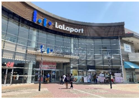
Mitsui Shopping Park LaLaport KOSHIEN

We will continue to advance various initiatives while cooperating with respective facilities with the aim of realizing a new form of retail property that is rooted in the local community and that grows in step with customers under our “Growing Together” concept for our retail properties.