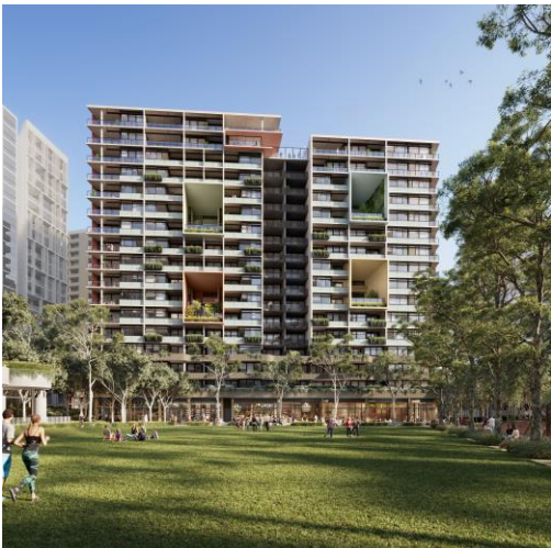
Digital image of the exterior of Treehouse

In addition, this project includes the community housing dwellings development project. The contribution of high-quality community house dwellings is one of the NSW Government's important policies to reduce the housing shortage caused by Sydney's population growth.