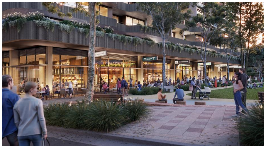
Digital image of retail facilities on the first floor