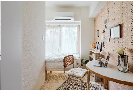
Private room (model room)