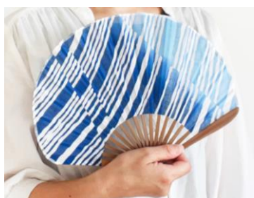
Store: Nijiyura Chusen Tenugui Re katachi sensu Price: ¥6,600 (tax included)