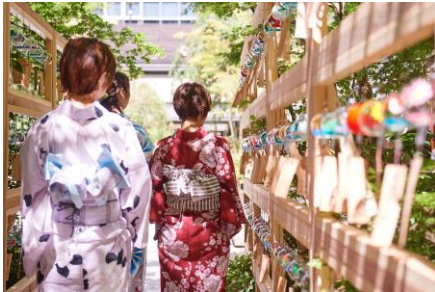
Cool down with the sights and sounds of wind chimes