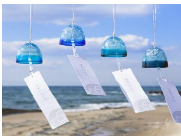
Store: Tsugaru Vidro Tokyo Midtown Yaesu Store Aomori No Umi wind chimes Price: ¥3,690 (tax included)