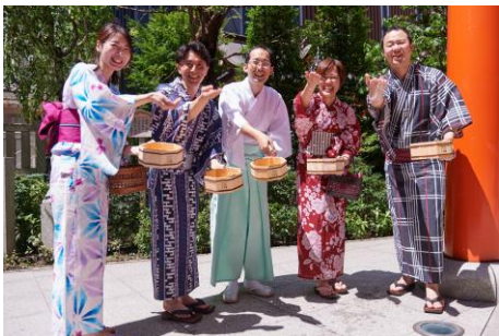
Take the heat out of Nihonbashi with uchimizu