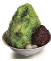
Store: Tsuruya Yoshinobu Ujikintoki Price: ¥1,430 (tax included)