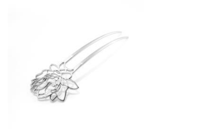
Store: meta mate Eslite Spectrum Nihonbashi Store KANZASHI flowers and seasons Price: ¥13,200 (tax included)