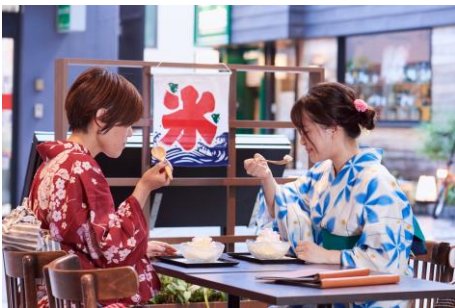
Cool down with shaved ice desserts