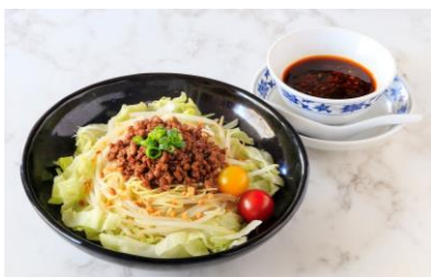
Store: JUKEI CASUAL KITCHEN Tantan ryomen Price: ¥1,400 (tax included)