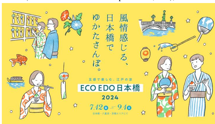
ECO EDO Nihonbashi 2024 main image

Support: COREDO Nihonbashi, COREDO Muromachi 1-3 and Terrace, Takashimaya Annex, Tokyo Tatemono Co., Ltd., Toray Industries, INC., Nihonbashi Takashimaya S.C., Nihonbashi Mitsui Tower, Nihombashi Mitsukoshi Main Store, Mandarin Oriental Tokyo, Mitsui Main Building, Mitsui Garden Hotel Nihonbashi Premier, YUITO/YUITO ANNEX (Nomura Real Estate Development Co., Ltd.), others