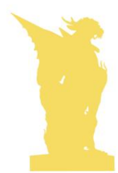
Silhouette of the hidden kirin