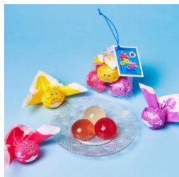
Store: Nippon Department Store Goldfish nebuta jellies, set of 3 Price: ¥740 (tax included)