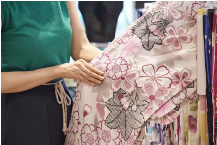
Rent a yukata from Nihonbashi Yukata Station

In Nihonbashi, where tradition and innovation meet, visitors can stroll the neighborhood’s elegant streets in their yukata, utilizing wisdom cultivated during the Edo era for the Japanese to live environmentally friendly lives, we provide a way to get through summer that is unique to Nihonbashi.