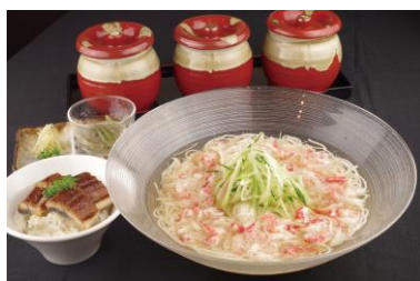
Store: Kanifuku Summer special crab somen with side serving of eel on rice Price: Weekdays ¥1,980 (tax included) Dinner/weekend lunch: ¥2,178 (tax included)