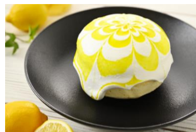
Store: ISHIYA NIHONBASHI Ishiya pancakes (lemon) Price: ¥1,600 (tax included)