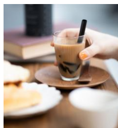
Store : DAYLILY SENSO BEAU-TEA Taiwan senso tea Price: ¥2,750 (tax included)