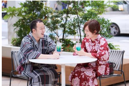
Feel cooler with dishes from the summer ecoedo menu