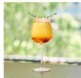
Store: Wang De Chuan Aiyu jelly oolong tea Price: ¥1,480 (tax included)