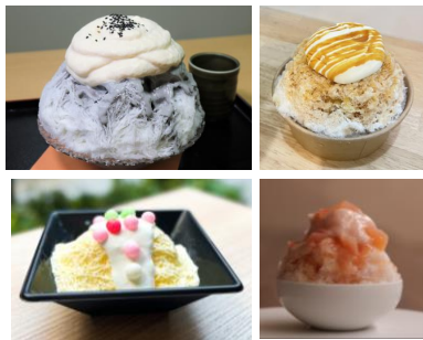
A choice selection of kakigori at the Shaved Ice Festival