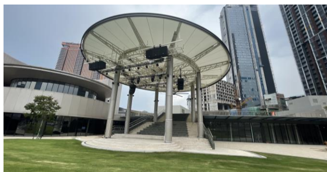
LaLaport BBCC Central Rooftop Garden