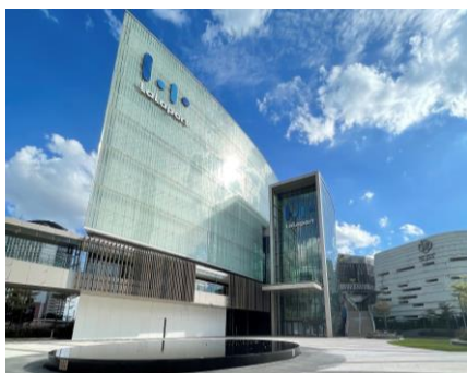
LaLaport BBCC exterior

Mitsui Fudosan will manage all the rooms together and smoothly handle residential facility repairs and maintenance. We also provide a full range of services to support a comfortable lifestyle, such as concierges that speak multiple languages including Japanese, house cleaning, and linen changes (for a fee). In addition, taking advantage of the location adjacent to LaLaport BBCC, where many Japanese supermarkets, bakeries, and restaurants are located, Mitsui Fudosan will consider offering services in collaboration with these facilities in the future.