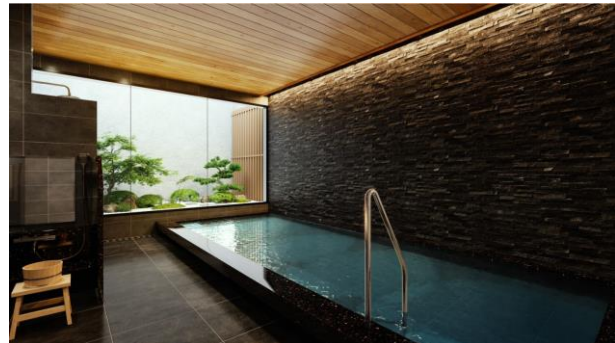
Large public bath image