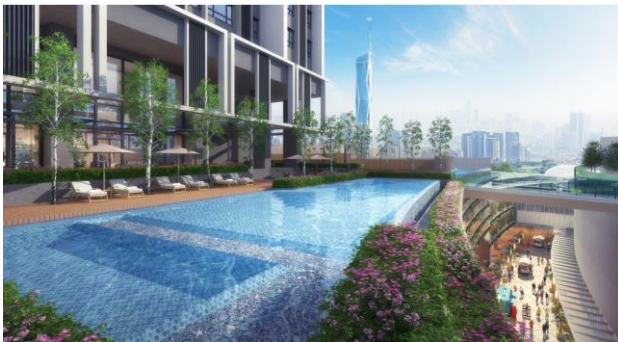
Outdoor pool image

Substantial array of shared facilities including a pool, large public bath, sauna, fitness gym, kids' room, and lounge. A variety of needs will be met.