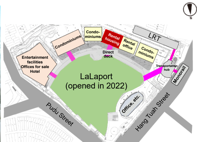
BBCC Project area site layout