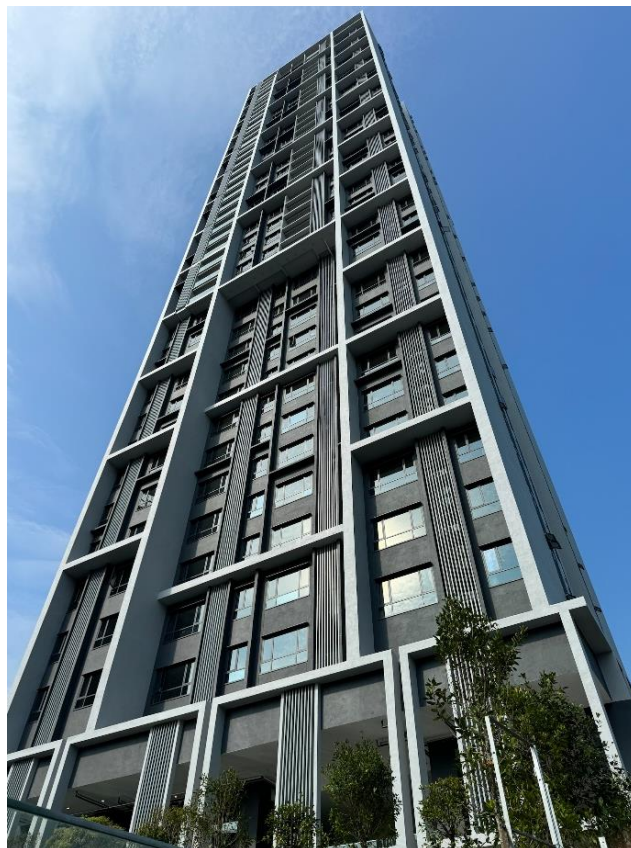
Mitsui Serviced Suites Bukit Bintang City Centre property exterior

The property is also directly connected to Mitsui Shopping Park LaLaport BUKIT BINTANG CITY CENTRE (LaLaport BBCC) (opened in 2022), which is developed and operated by our Group within the BBCC Project and offers a wide range of Japanese stores, restaurants, and daily necessities. With the opening of the property and LaLaport BBCC, Mitsui Fudosan will work to further promote its strength of mixed-use neighborhood creation.