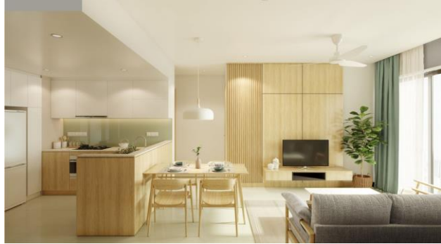
Living room image