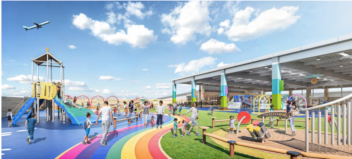
Image of the rooftop park