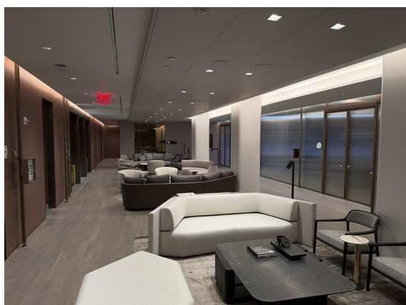
Interior décor of the lounge

The only people who can use the lounge other than the tenants of the 1251 Building are WORKSTYLING members. Tickets to use the lounge can be purchased from the members' website and the lounge can be accessed with a QR code.