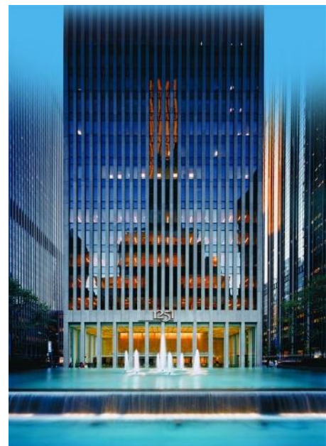
Exterior view of 1251 Avenue of the Americas