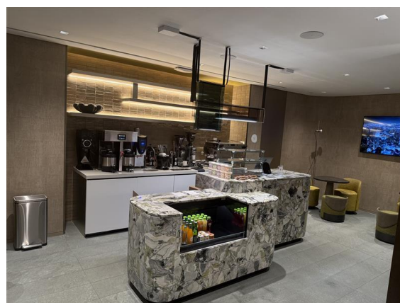
Café area within the lounge