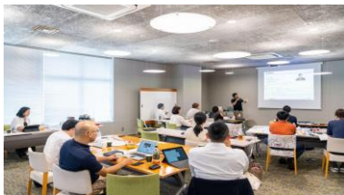
From the business plan creation seminar

Experts will lecture on warnings for startup contracts and key points in capital policy and fundraising, etc.