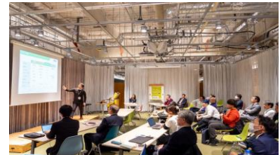
Scene from the final demo day