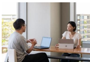
Mentoring in progress