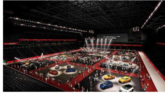
When used for an exhibition