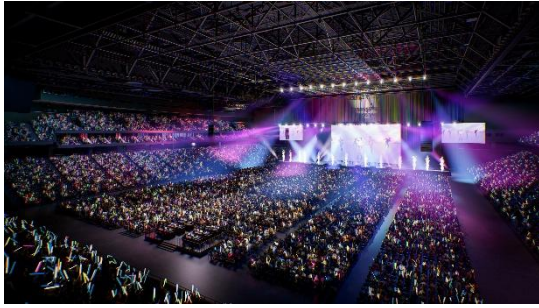
When used for a music performance