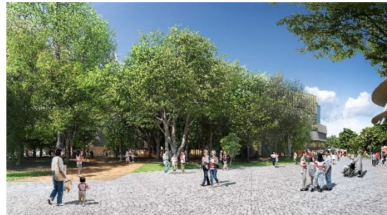
Exterior of the northeast side of the stadium