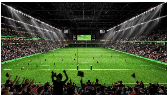
When used for a rugby match

In terms of environmental initiatives, the stadium will be certified as LEED GOLD® and ZEB Ready to achieve world-class performance. At the same time, universal design and the effective use of ICT will ensure that the stadium is an easy-to-use venue for all spectators.