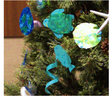
Sample of upcycled interior decorations

Haimurubushi is deeply grateful to be located in the one-of-a-kind natural setting of Kohama Island and actively promotes a variety of environmental conservation efforts to help preserve the natural beauty of the Yaeyama Islands for future generations. Guests staying multiple nights are encouraged to participate in the resort's eco-stay program, which offers the option to skip room cleaning and linen changes. In addition, the resort has eliminated the provision of bottled drinking water, instead installing water dispensers throughout the property and offering reusable bottles for guest use.