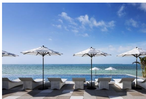
Main Pool (infinity pool)