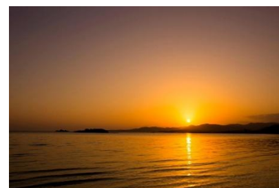
Sunset over Iriomote Island

Haimurubushi allows guests to immerse themselves in the magnificent landscapes of the Yaeyama Islands, while the skies above shift from dawn to twilight and into a starry night. The Oceanfront Pool Villas are specially designed to highlight the surrounding natural landscape, above all the sunset over Iriomote Island, a UNESCO World Natural Heritage site, allowing guests to enjoy breathtaking vistas throughout their stay. Immerse yourself in a tranquil moment as the sky subtly changes color, leaves rustle in the breeze, and birds sing.