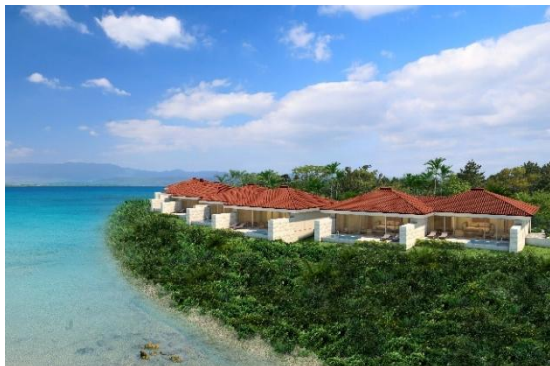
Conceptual rendering of a bird's eye view of the Oceanfront Pool Villas

The villas will fully embody Haimurubushi’s concept of “Happiness in Doing Everything, or Nothing at All,” allowing guests enjoy a special moment of relaxation as time drifts gently alongside ever-changing scenery.