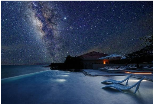
Quiet Pool under a starry sky (temperature controlled, available all year round)