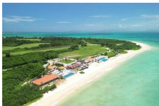
Pool & Beach Area