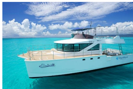
Conceptual rendering of private access (optional service)

*For details on the in-room dining and private access services, please visit Haimurubushi's official website. (Information is scheduled for release around early June 2026.)