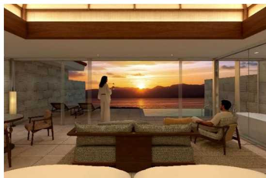
Conceptual rendering of a sunset view from a villa