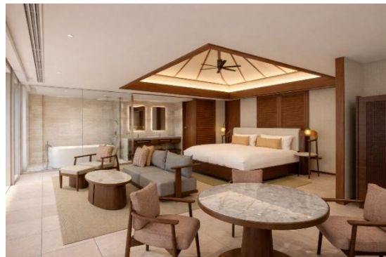
Conceptual rendering of the villa interior