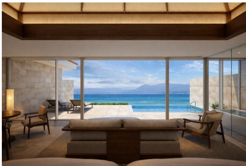
Conceptual rendering of Iriomote Island viewed from an Oceanfront Pool Villa

The sun slowly sets amid an ever-shifting sky, with Iriomote Island on the horizon beyond beautiful shallow waters. Guests can surrender themselves to the breathtaking nature of the Yaeyama Islands to enjoy a moment of deep relaxation as time drifts gently.