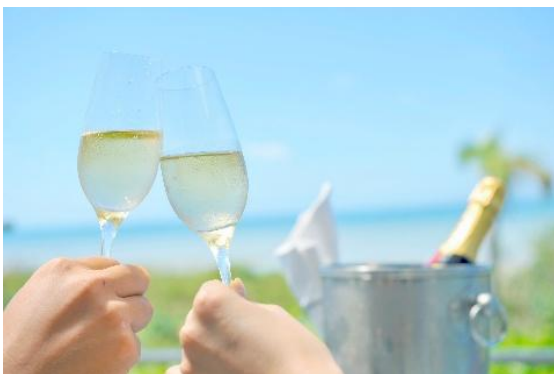
Conceptual rendering of a welcome amenity