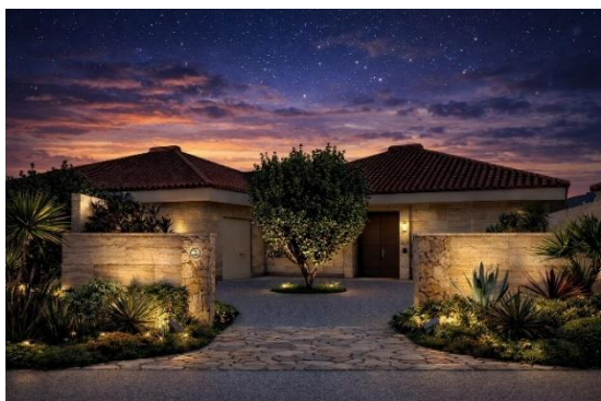
Conceptual rendering of the Haimurubushi Villa Entrance for villa guests