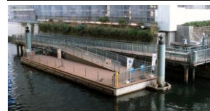
Arriving to Nihonbashi Pier (Chuo City Disaster Prevention Boat Pier)