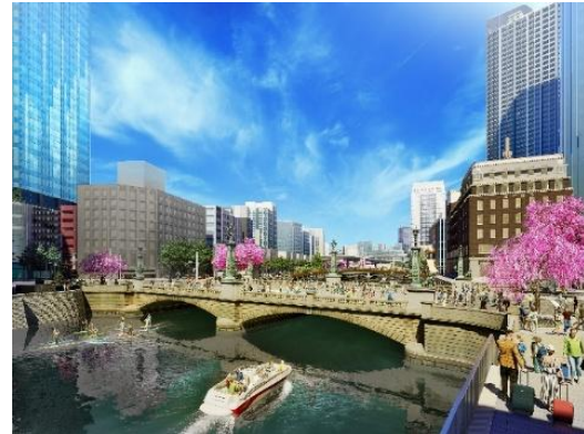
The viaduct is scheduled for removal by around 2040. A neighborhood open to the sky and river unfolds.*

* These computer-generated images and renderings are conceptual and do not represent the actual details of the plan.