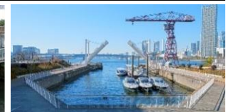
Arriving to Toyosu Pier (Urban Dock LaLaport Toyosu)

(*1) The above operating schedule is subject to change due to river construction work, weather conditions, and other factors.