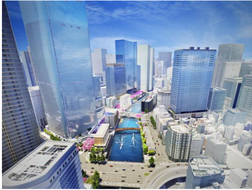
Nihonbashi River Walk after removal of the Metropolitan Expressway viaduct*

Nihonbashi River Walk is the name of the area encompassing redevelopment districts along the Nihonbashi River and their surroundings, centered on a space with a close affinity to water and a riverfront pedestrian network. In this area, the Metropolitan Expressway Nihonbashi Section Underground Relocation Project and the five current redevelopment projects are cooperating with one another to advance the creation of a neighborhood open to the sky and river. This initiative is being carried out in unison with the Japanese government, Tokyo Metropolitan Government, Chuo Ward, Metropolitan Expressway, private-sector businesses including redevelopers, and the community. The combined area of the 5 development zones is approximately 11 hectares. By creating an expansive space with a close affinity to water, the aim is to transform the Nihonbashi-Yaesu area into a new face of Tokyo as a waterfront city.