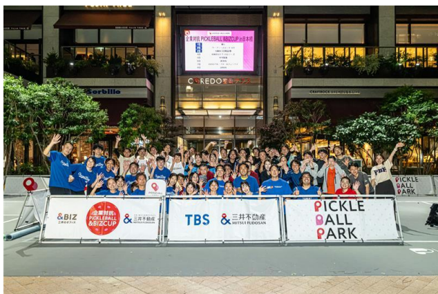
“&BIZ event,” the participatory event series for tenant companies A scene from “&BIZ CUP,” the inter-company pickleball tournament

At its offices, Mitsui Fudosan is working to enrich workers' daily lives and to provide services that help maximize the performance of tenant companies through &BIZ.