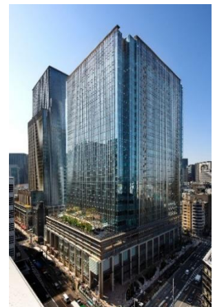
Nihonbashi Muromachi Mitsui Tower