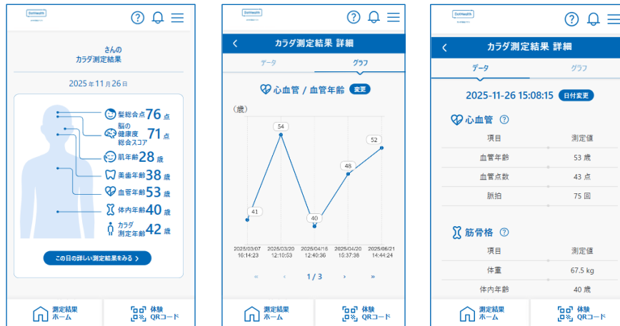
Sample screens of the Body Analysis Service app

Through continued use, the Service helps users shift their awareness and behavior around health and provides ongoing health support as part of daily life. The Service is designed for office workers to use during their lunch breaks or between tasks. It integrates routine activities, such as tracking daily changes in physical condition, and promotes health awareness by allowing users to share their results with others. It is also expected to contribute to higher productivity through improved condition management.