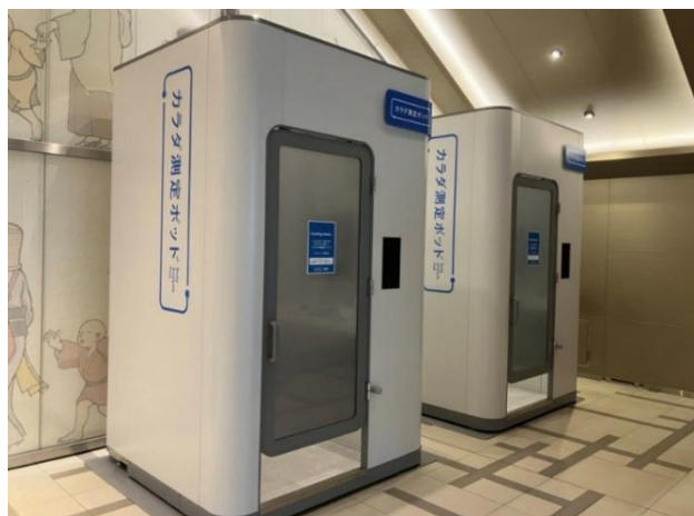
Body Analysis Pod installed at Nihonbashi Muromachi Mitsui Tower (B1 floor)

Given the context of growing corporate interest in health and productivity management and human capital, and the rising importance of initiatives that contribute to employee wellbeing, the installation at Nihonbashi Muromachi Mitsui Tower is aimed primarily at office workers based at the tower and surrounding offices, providing an environment in which they can visualize their health status as part of daily life and supporting the creation of new healthy habits. Mitsui Fudosan will offer the service as part of &BIZ—its suite of services for office workers at its properties—as an initiative that supports the health and wellbeing of employees at tenant companies. By also making the Service available to visitors to the area, Mitsui Fudosan and the PHR Connect Consortium aim to extend their impact to the wider neighborhood and to establish a new healthcare experience as part of everyday life.